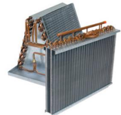
EVAPORATOR & DX