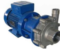
WARRENDER SR MAG DRIVE