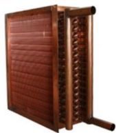
CUSTOM & OEM