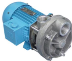
MTH E51 / T51