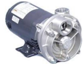
MTH E41 / T41