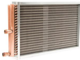
WATER HOT | COLD | GLYCOL | REHEAT