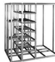
FRAMES & SUB-STRUCTURES