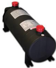
MTH HERMETIC HP31