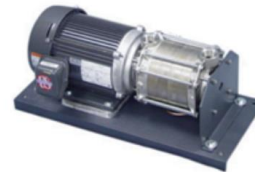
MTH M50 / L50