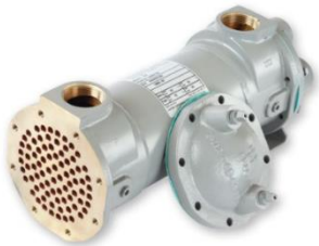
COPPER ALLOY STAINLESS STEEL