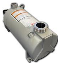
MTH HERMETIC HP41