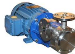
WARRENDER WMTA MAG DRIVE